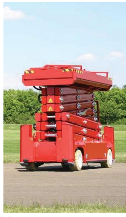
Manufactured within EG-directives 98/37/EG. Certificated according to EN 280. Subject to change without notice.